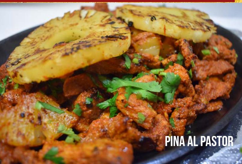
PINA AL PASTOR

Ribeye, chicken breast, pork chops, shrimp, grilled onions, chiles toreados with a home-made chorizo salsa. Topped with avocado and shredded cheese. Served with rice, beans, and tortillas and your choice of three salad sides. Enough to fill two! 23.50