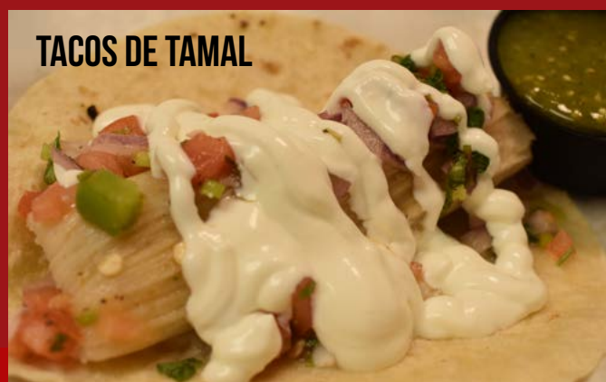
TACOS DE TAMAL

Grilled chicken strips grilled with chorizo, and pineapple. Sprinkled with shredded cheese. Served with rice, beans, and tortillas. 14.99